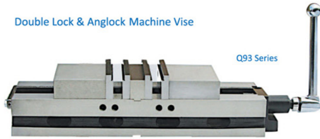
Double Lock & Anglock Machine Vice