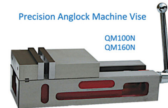
Precision Anglock Machine Vice