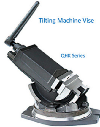
Tilting Machine Vice