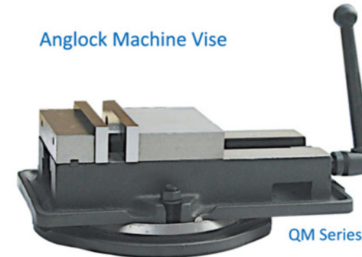
Anglock Machine Vice