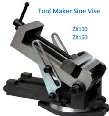
Tool Maker Sine Vice